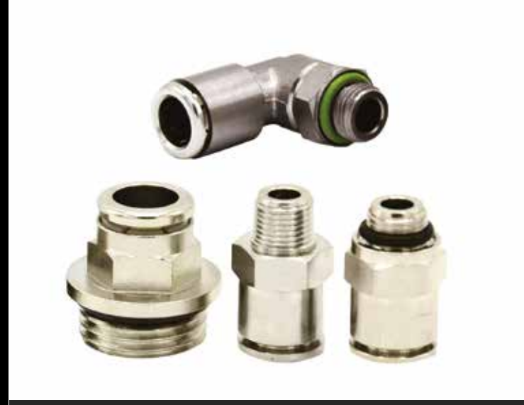
PNEUMATIC QUICK COUPLINGS