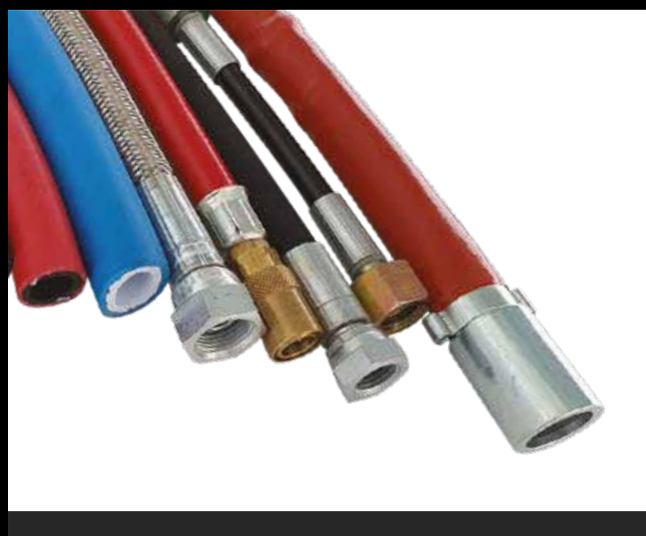
HOSES FOR WATER, AIR AND OIL