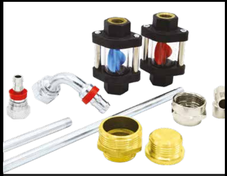
FITTING, PLUGS AND ACCESSORIES