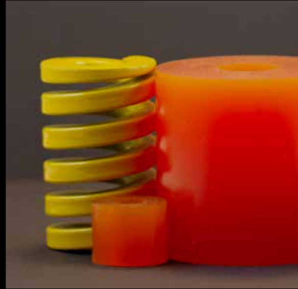
ISO 10243 AND ELASTOMER SPRINGS