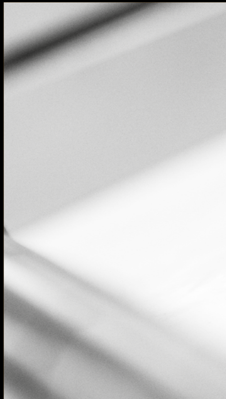
MOULD BASES CONFIGURATOR